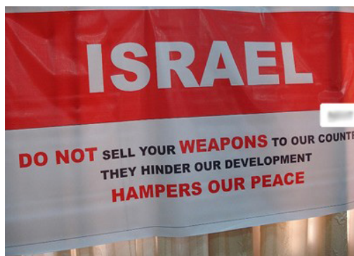
Banner at disarmament conference in India