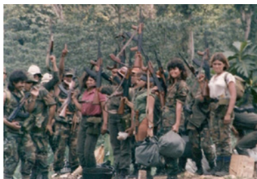
Young Nicaraguan Contras armed with Galil rifles from Israel.