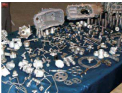
Israeli arms sold to Iran during the Iran-Contra scandal