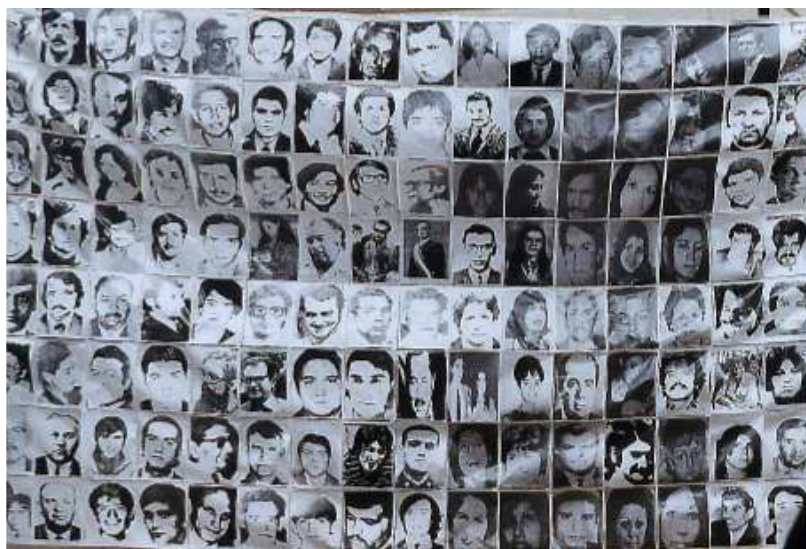
Los Desaparecidos: Chileans disappeared by Pinochet's regime